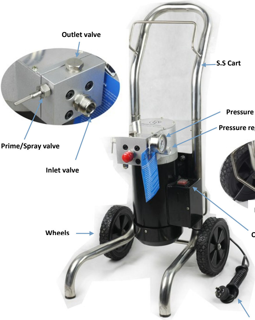
S.S Cart Pressure Gauge Pressure regulator