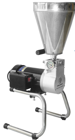
DP-6818 with 5L S.S Hopper(Not included)