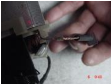
Step 7: Put heat shrinking tube in carbon brush side. Take the snap-fit between motor wire and carbon brush wire.