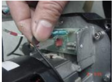
Step 3: Remove two wire of motor. Socket color is green.