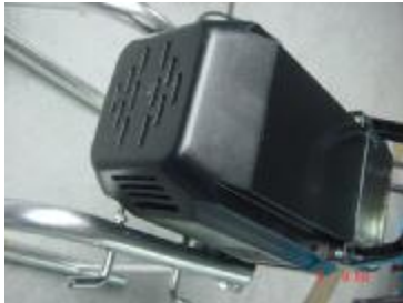
Step 1: Remove screws and shell. (5mm. Hex Wrench)

Prepare: 5mm Hex Wrench; Straight Screwdriver; Shear; Needle nose pliers or vice; heat gun or hair dryers: