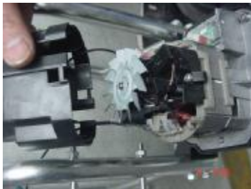
Step 4: Remove motor Cover