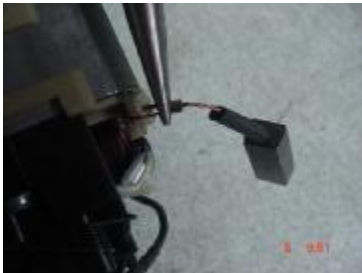
Step 8: Compect snap-fit hard. Lock the motor wire and brush wire together. (needle nose pliers or vice)