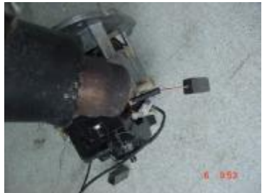
Step 9: Put the heat shrinking tube on snap-fit's location. Try to make 50°C wind on tube. Tighten the wires.( heat gun or hair dryers)

At the end, please put the carbon brush in the hole, and put the compression bar back. Assemble motor cover, plug motor wires. Take on the shell.