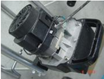
Step 2: Cock up top and under buckle, Remove motor cover ( Straight Screwdriver )