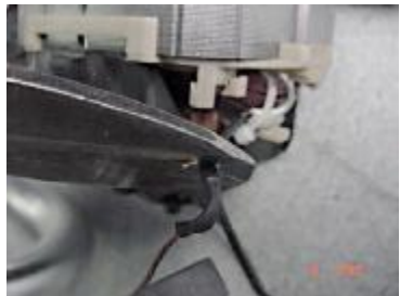
Step 6: Cut off the Carbon brush line. (Shear for Brass wire)